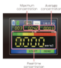
Real-Time Measurement Real-time concentration Maximum concentration Average concentration