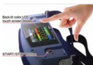
Easy Operation Color LCD touch screen display and one button START/STOP operation