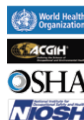
Meets Guidelines Meets international guidelines and protocols