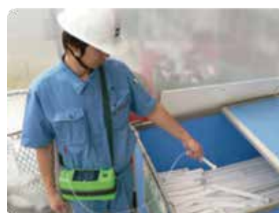
Shoulder & waist sling design to allow hands-free carry & operation