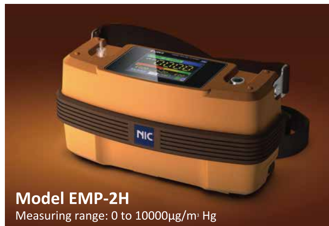
Model EMP-2H Measuring range: 0 to 10000 \mu\text{g}/\text{m}^3 Hg