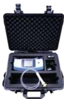
EMP-2 comes with a robust carry-case