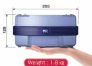
Compact & Light weight Weight only 1.8kg