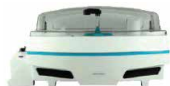
Smartchem 300 Up to 300 test/hour