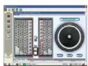
User friendly software