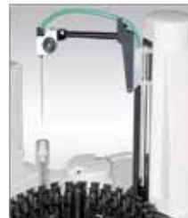
Computer controlled Micropipetor