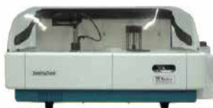
Smartchem 170 Up to 170 test/hour