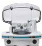
Smartchem 140 Up to 140 test/hour