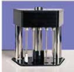
Washing station for reusable cuvettes