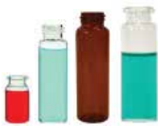
Headspace vials, VOC vials, Storage vials, etc