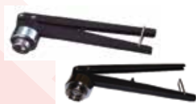
Crimper & Decrimper