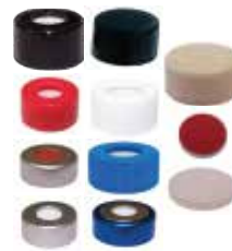
Caps and Septa