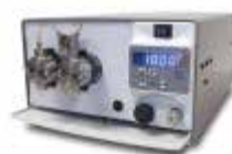
Dual Piston Pumps