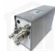
Pumps for Fluid Transfer