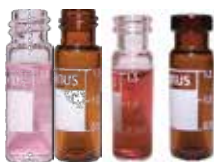
Screw Cap Vial Snap Cap Vial Crimp Cap Vial