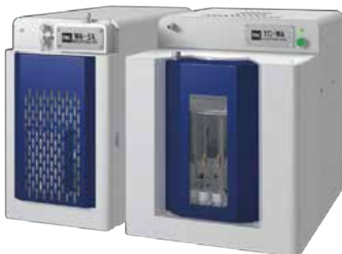
WA-5 with TC-WA 30 position tube auto-sampler for mercury collector tubes