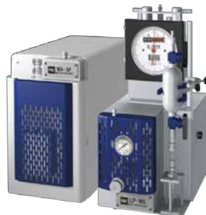
WA-5 with Heated Vaporizer & Pressure Let-down System for direct sampling from pressurized cylinders