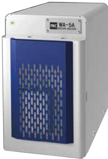
WA-5 Standalone system for direct injection and sampling from Tedlar bag

For ultra trace level of Mercury in gaseous matrices